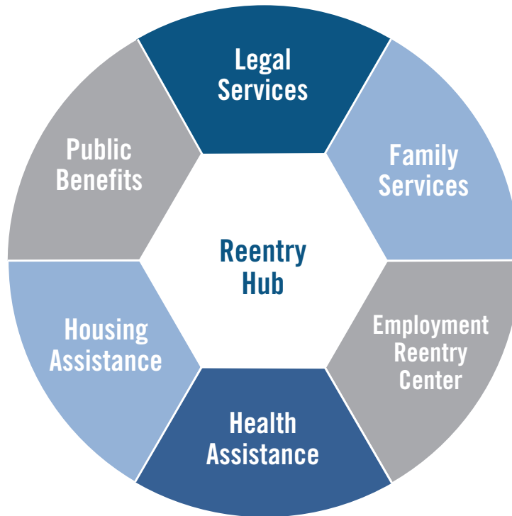
Figure 3: Reentry Hub and Necessary Services

Referrals coming out of this reentry hub should be based on an individual’s assessed needs and case plans, their geographical location and proximity to services, and sometimes, the person’s ability to pay for the services. Additionally, since housing options are often limited for all reentry populations in Erie County, this reentry hub can provide some limited emergency shelter if it is a physical space or provide emergency shelter options through an external partner, if virtual.