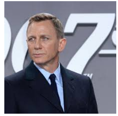
Daniel Craig, Actor

Homelessness can affect anyone; in fact, several celebrities have experienced it themselves. Homelessness can result from many circumstances, some even without notice. Some examples are: